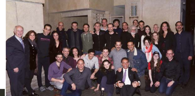
The Band's Visit , Come From Away , The Parisian Woman

Thank you to these generous Broadway companies who gave of their time and talent through their Special Performances! Many Broadway shows add an extra performance to their regular schedule as a benefit for The Actors Fund. All proceeds from these exciting occasions go to support programs and services for everyone in performing arts and entertainment. We look forward to seeing you at the next Special Performance or Producer's Picks event!